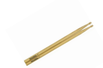
Snare sticks Innovative Percussion IP-KW