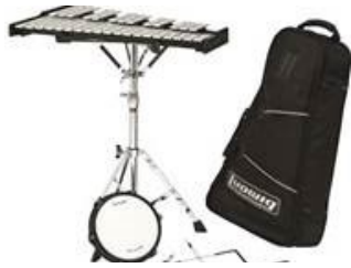
Beginner percussion kit (comes with case, stand, snare pad, and bell set)

Please obtain the following items from a local music store before school starts in August.